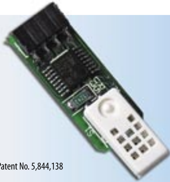
U.S. Patent No. 5,844,138